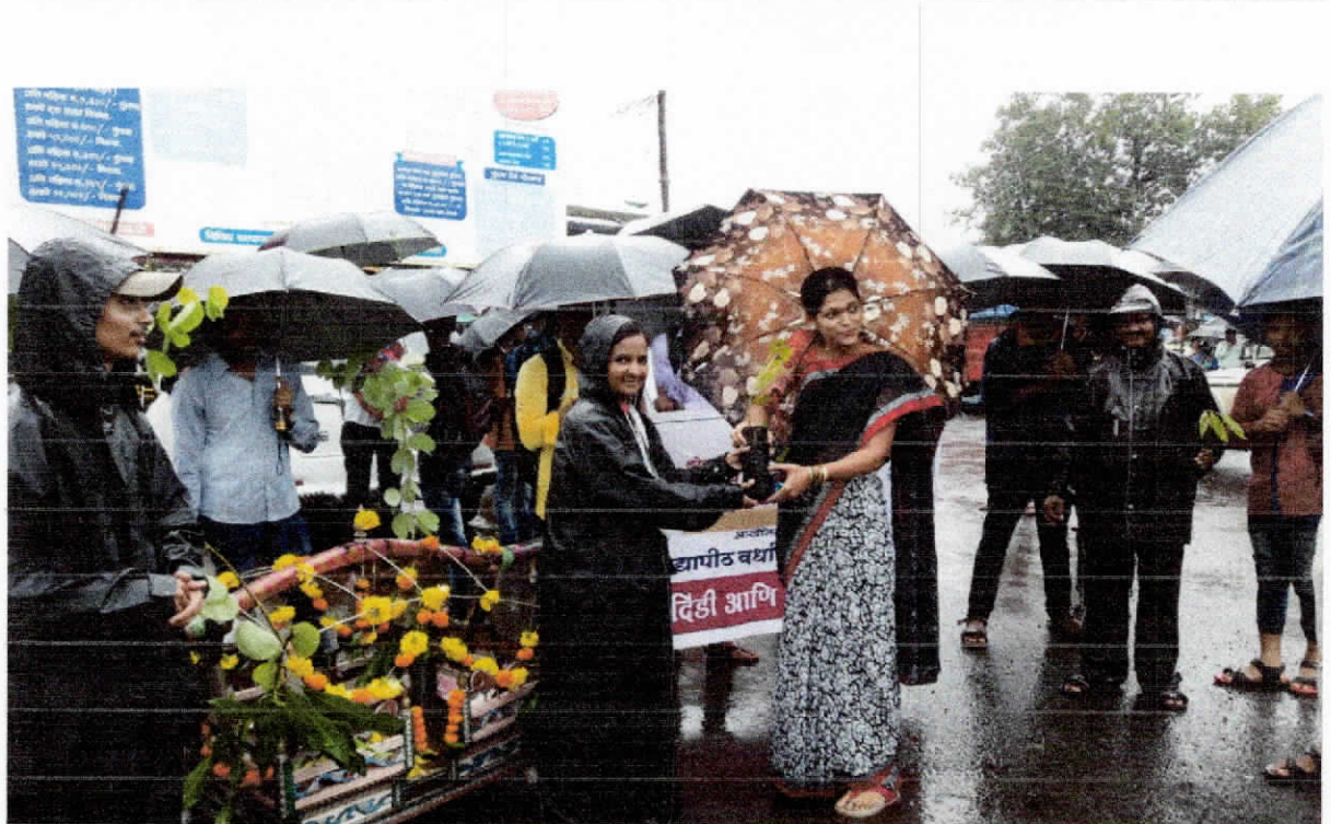
Figure 3 Vraksha dindi

[Signature] Vice Principal Loknete Gopinathji Munde Arts, Commerce & Science College Mandangad, Dist. Ratnagiri-415203