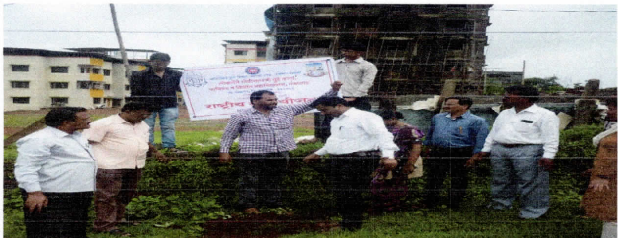
Figure 1 Tree plantation

[Signature] Vice Principal Loknete Gopinathji Munde Arts, Commerce & Science College Mandangad, Dist. Ratnagiri, 415203